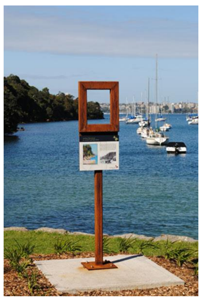
Interpretive signage on the Curlew Camp Artist's Walk