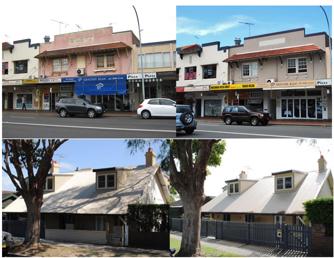
Outcome of works funded by the Mosman Heritage Assistance Fund (Left - Before, Right - After)