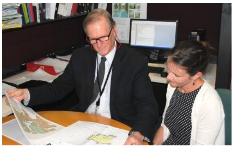
Council's Heritage Advisor

Council provides and fully funds a heritage advisory service. A consultant heritage architect is contracted for the service, which has run continuously since 1996. The heritage advisor provides free advice to owners of heritage properties as well as advice to planners on development applications and applications for the Mosman Heritage Assistance Fund.