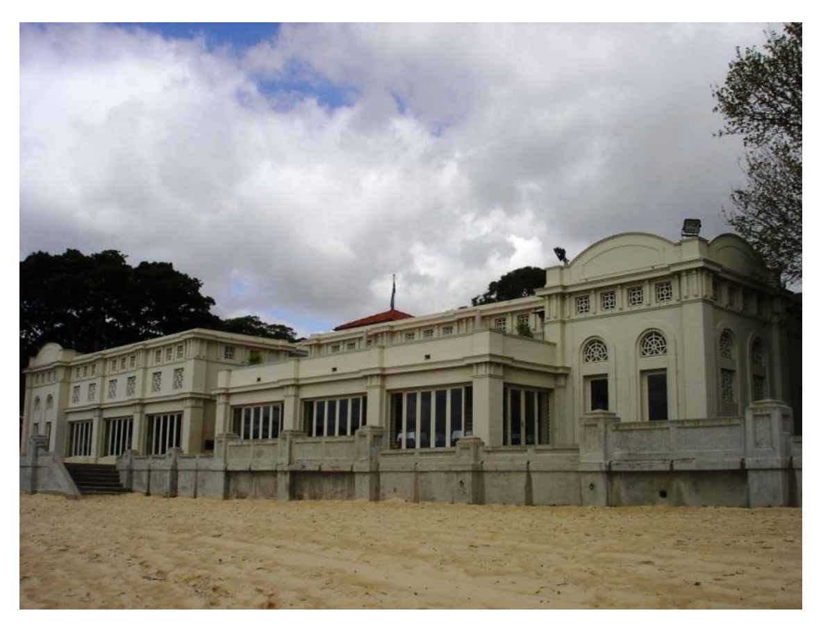
Bathers Pavilion - Balmoral

• 'Aboriginal Heritage Study of the Mosman Local Government Area', September 2005.